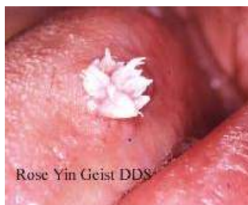
Fig. 3. Oral verruca vulgaris

chemical ablation, laser treatment but surgical excision is effective for verruca vulgaris [35,38].