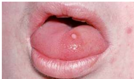
Fig. 5. Oral squamous papilloma

Its association has been found with HPV genotypes 6 and 11 but the involvement HPV 58 has also been reported [43]. Oral squamous papilloma is a benign painless lesion of the oral cavity usually seen on the vermilion portion of the lips, soft palate, hard palate, lingual, frenulum, lower lip and uvula. They are single and less than 1cm in size papillary like projections which may show keratinization. Surgical removal is the treatment of choice. Topical use of imiquimod is another non-invasive treatment of multiple persistent oral squamous cell papillomas in HIV-patients [44].