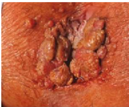
Fig. 9. Genital/condyloma acuminata

Genital warts are a sexually transmitted infection associated with human papillomavirus 6, 11, 13, 40, 42, 43, 44, 54, 61, 72, 81 and 89, but most frequently reported are 6 and 11 [14,15]. These are soft growths that occur on the genitals. The most frequently involved areas in males are penis, scrotum, groin, thighs, inside or around the anus and in females vagina, anus and cervix. Patient may suffer from discomfort, itching and pain. These are diagnosed by Pap smear. Genital warts may go away with time but few available options include some topical treatments such as imiquimod [50], podophyllin [51] and podofilox, and trichloroacetic acid [52] and if persist they may require surgical removal by burning, freezing, or laser. Any vaccine that contains HPV 6 & 11 genotypes can be used for prevention [50].