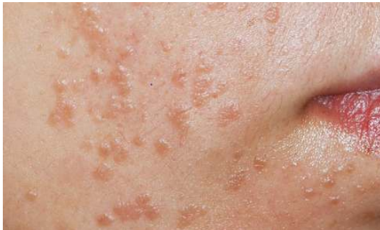
Fig. 7. Flat warts

Flat warts are associated with HPV 3, 10, 27, 28, 41 and 49 [46,47] and are also known as juvenile warts because they are not found in people above 40 years of age. These are smooth, flat and smaller in size as compare to other types and occur only in children and adolescents. On examination they look like flat growth similar to a mole. Patients may present with the complaint of itching. Step-up therapy of 5-aminolevulinic acid photodynamic can play a role with fewer side effects [12]. Removal of the upper parts of the hyperkeratotic wart lesions by CO 2 laser initially could enhance the absorption of the photosensitizer in this treatment [48].