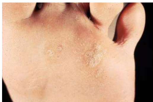
Fig. 10. Foot warts

People may contract this infection through barefoot activities. Clinically they may present with a rim of keratin surrounding a softer keratotic plug, with scattered capillary points. Histologically, a disorganised granular layer, with koilocytic cells and parakeratotic cells with nuclear inclusions in the upper layers seen. It may bleed due to presence of these capillaries [16]. This can be treated by destructive methods, caustic acid, chemotherapeutic agents, hypersensitivity agents and miscellaneous agents such as salicylic acid preparations. A study reported that citric and nitric acids are beneficial against common warts [54].