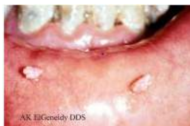
Fig. 2. Oral condyloma acuminatum

The most frequently involved genotypes are 6 and 11 but other types may also be found [30]. Condyloma acuminatum, also called as venereal wart is an infectious, sexually transmitted disease which appears as multiple small, white or pink nodules, which proliferate and form cauliflower-like growth in wet areas of the body for example the gingiva, lips, tongue, soft palate, genitalia, and other places [31]. This infection is rarely found in the oral cavity but people who have anogenital warts may transmit this infection by self-inoculation or through sexual contact. Fetomaternal transmission is also possible. Cigarette smoking or betel quid chewing are other predisposing risk factors to HPV infection [32]. They are more common in people who are in their second decade of life, but if present in children it may indicate sexual abuse [17,33]. They may cause oropharyngeal, anogenital, or cervical cancer [34]. Treatment includes surgical excision, cryosurgery, electrocautery, and laser excision [35].