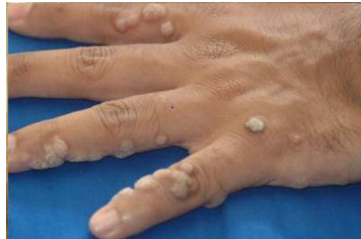
Fig. 8. Butcher's wart

This type is associated with HPV 7 [49]. Common warts are the most frequently occurring warts on the hands but they might also appear anywhere on the body. The preference for the hands partially reflects the high likelihood that hands will contact a contaminated environmental surface during play or work. It is also caused by the natural tendency for young children to pick or scratch at existing warts, spreading them to unaffected skin, a process known as autoinoculation. Common warts occurring beneath the fingernails are called subungual warts, whereas around the fingernails are called periungual warts. These are also found on the hands of people who frequently handle raw meat hence named as Butcher's wart.