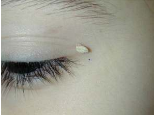
Fig. 6. Filiform warts

cryotherapy, surgical excision, or laser light. Treatment with oral Zinc Sulphate could be effective [45].