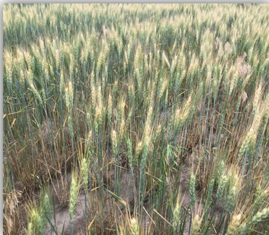
Fig. 1. Symptoms of terminal heat stress on wheat