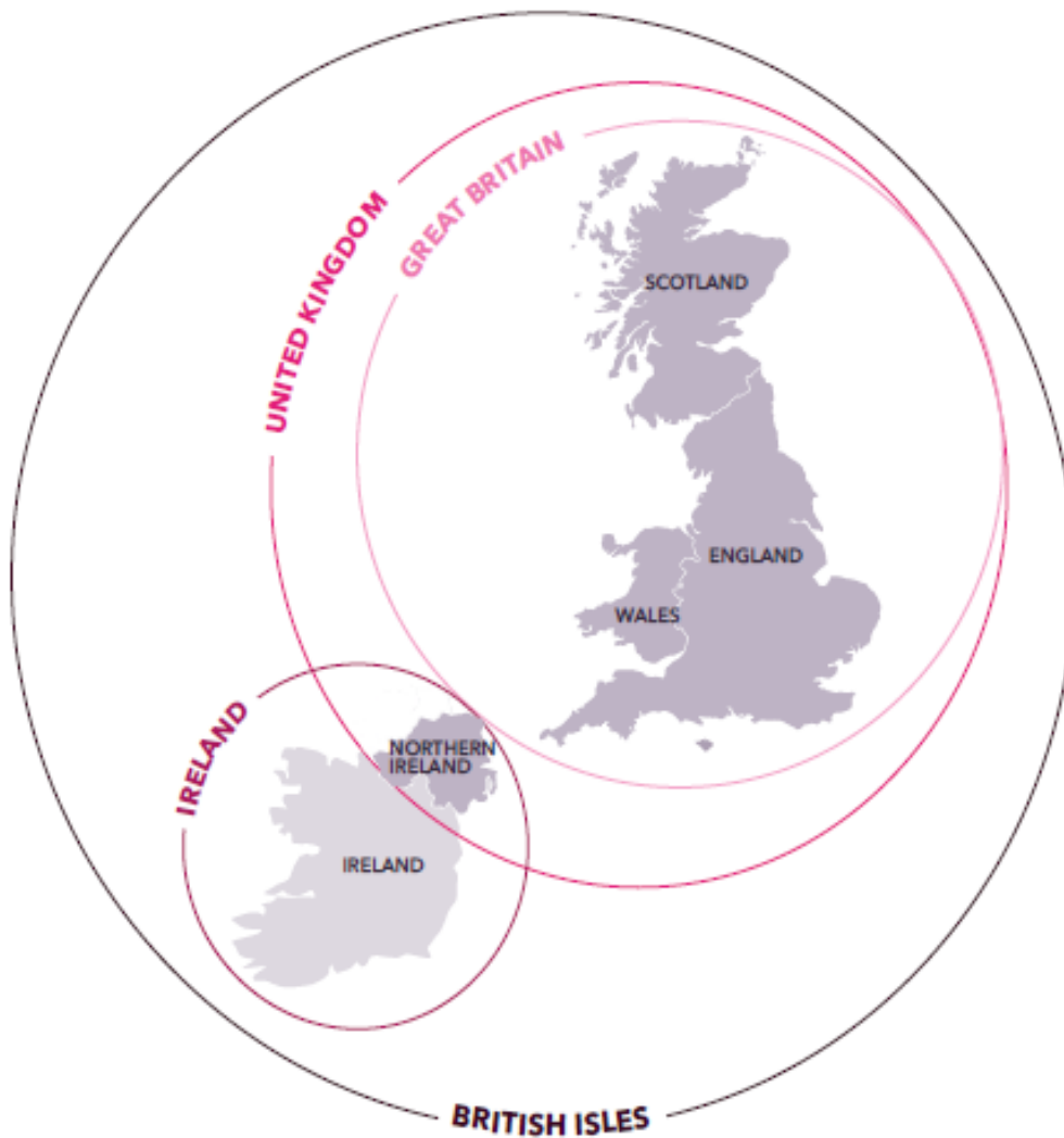
Fig. 1. The Brexit Map

To report and describe the Regulatory changes in different areas which are affected pursuant to the Brexit and to detail out the new guidelines that were derived from the Medicines and Healthcare products Regulatory Agency [MHRA].