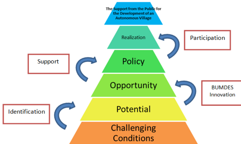
Fig. 3. Scheme for the Embodiment of an Autonomous Village Through the Role of BUMDES