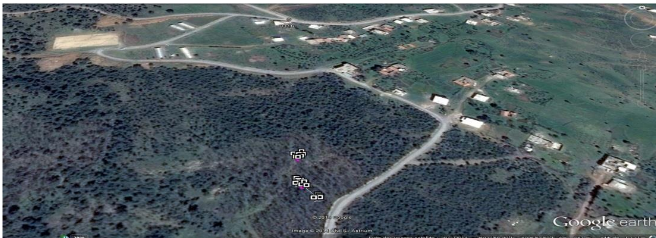
Figure 1. The canton of BeniAfak (forest Zouagha, Mila).

(Gema et al., 2011). The forest fire is one of the most widespread disruption and potentially most destructive affecting fungi that inhabit the soil (Lygis et al., 2010). The genus Trichoderma includes a set of saprophytic imperfect fungi which are commonly found in soil, dead wood, plant debris and aerial parts of the plants. They are easily recognized in the culture through the generally greenish color of their spores and their typical phialides (bowling-like).