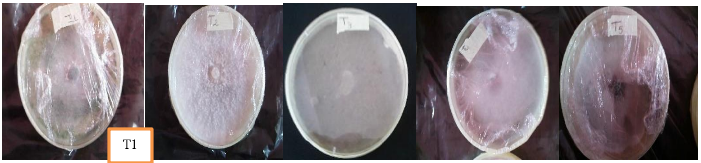
Figure 2. Representative images of controls of five fungal genera after six days.