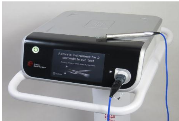
Fig. 3. Harmonic generator