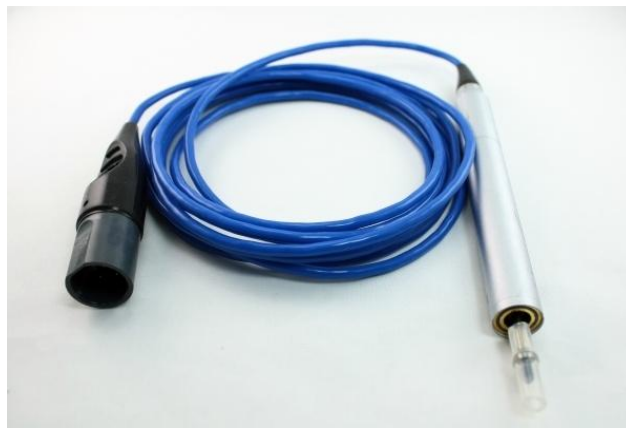
Fig. 2. Harmonic cord