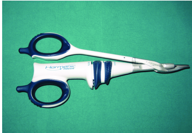
Fig. 1. Harmonic focus hand piece