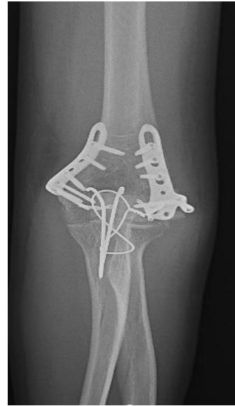
Fig. 4. X-ray at final follow up