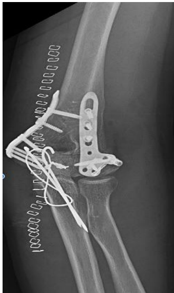
Fig. 3. Immediate postoperative fixation