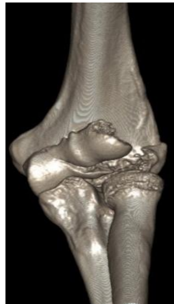
Fig. 1. Ct scan showing fracture configuration

A 30 years old gentle man presented to ER of our tertiary care hospital with a right elbow injury after a motor vehicle accident. Patient did not have any distal neurological or vascular deficits. It was a closed fracture. The radiographs and computer tomography (Figs. 1 and 2) revealed, complex shear fracture of the distal humerus with involvement of capitellum and trochlea and also the medial column. The patient did not have any head injury or any other fractures.