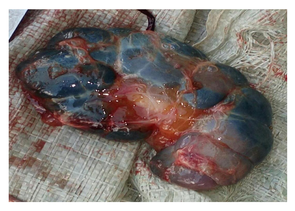
Fig. 3. An image of a left kidney showing dark blue discoloration of the kidney surface

Based on gross pathology, the disorder was diagnosed as renal lipofuscinosis (black kidneys). The diagnosis was made after ruling out renal hemosiderosis, hemochromatosis, and MRCC in the list of possible causes of kidney discoloration based on the absence of gross pathological findings characteristic of each of these diseases. Renal hemosiderosis was ruled out because the dead animal was not anemic; this was indicated by a lack of pallor. Anemia is a characteristic consistent feature of hemosiderosis [14,18-22]. Hemochromatosis was excluded due to the lack of liver fibrosis, a gross pathological finding involving the liver that has been consistently reported in cases of hemochromatosis [12,15,23-27]. MRCC was ruled out because the kidneys were grossly free of tumor tissue, which is a characteristic feature of renal cell carcinoma [28-32] and other types of cancer. Due to budget limitations, histopathology could not be performed to confirm the diagnosis.