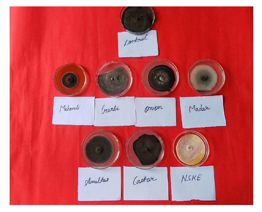
Plate 1. Response of botanicals against Alternaria solani on mycelial growth