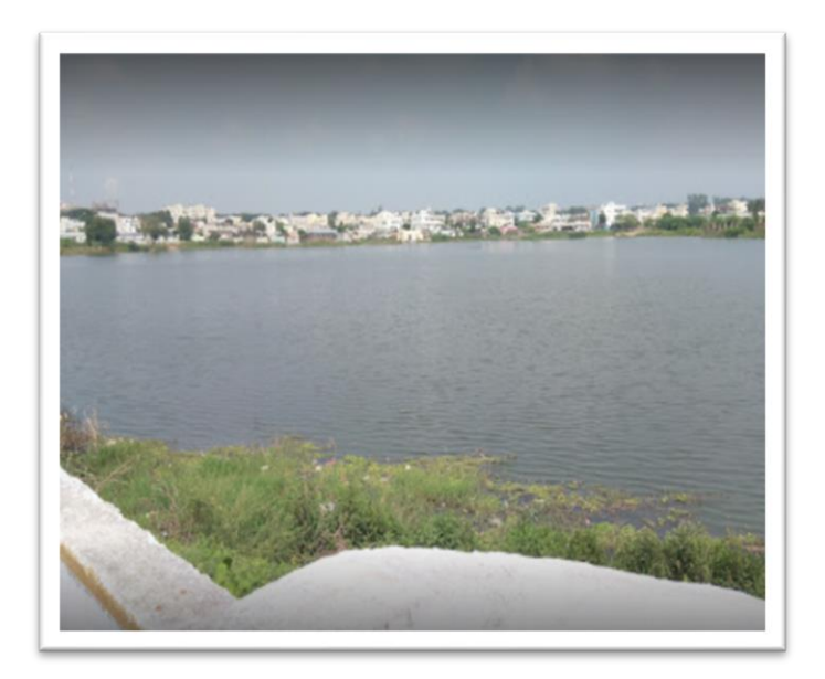
Fig. 1. Rathi Cheruvu

using mercury thermometer, visual, digital pH meter respectively. While dissolved oxygen and Total dissolved solids were analyzed onsite with water quality monitoring kit at the sampling sites. Rest of the parameters was analyzed according to standard methods [8].