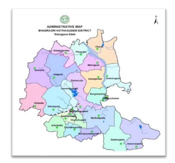
Fig. 3. Map of Bhadradri Kothagudem District

Rajyalaxmi and Aruna; Asian J. Env. Ecol., vol. 23, no. 6, pp. 12-20, 2024; Article no.AJEE.114668