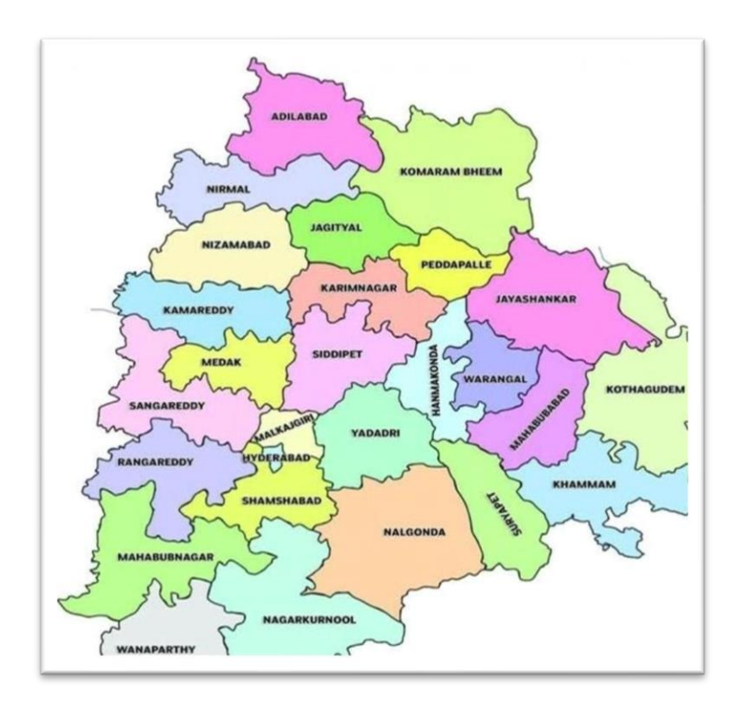
Fig. 2. Map of Telangana State