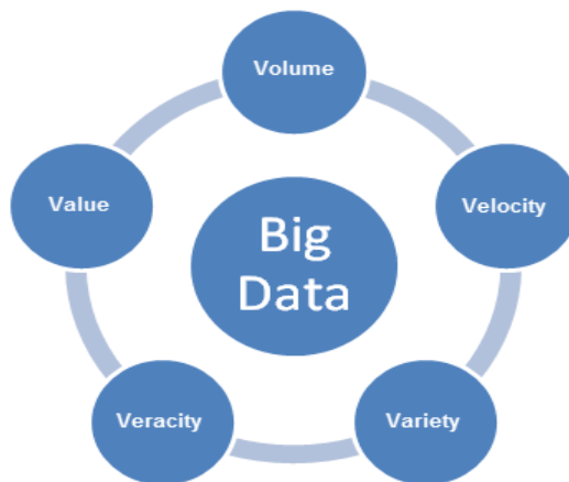
Fig. 2. Big Data Benefits