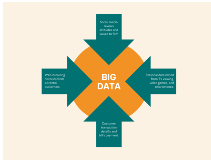
Fig. 3. Big Data