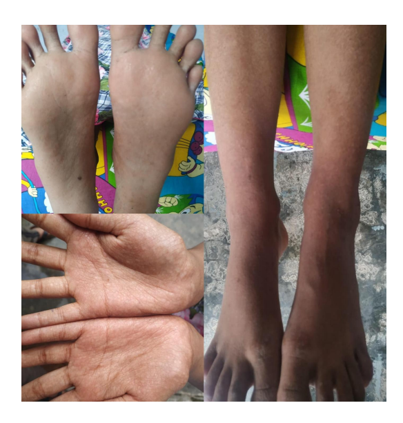
Fig. 3. Three months later, photograph shows decrease in the rain-drop pigmentation compared to Fig. 1