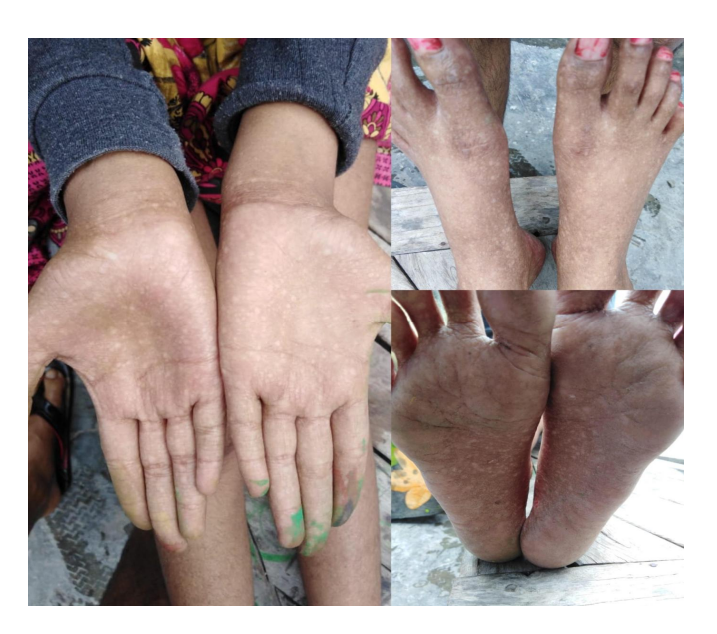
Fig. 1. Patient's photographs show plantar keratosis, and spotty pigmentation and depigmentation (rain-drop pigmentation) involving the palms, and dorsum and soles of the