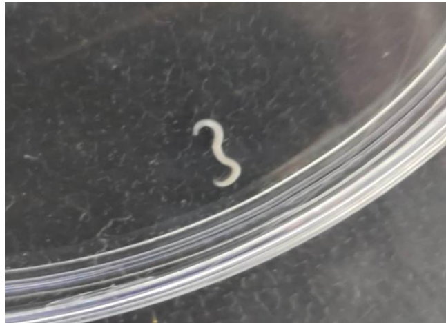
Fig. 2. Adult Worm detected in duodenal aspirate