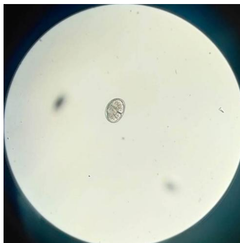
Fig. 4. 40X Microscopic view of egg of hookworm in duodenal aspirate