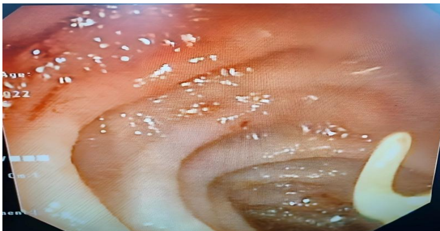
Fig. 1. Upper gastrointestinal endoscopy showing adult hookworm

On examination, weight was 8.3 kg with edema; height was 83 cm (less than the 3rd centile); mid-upper arm circumference (MUAC) was 10 cm; Vitals: HR-88/min, RR-20/min, B.P.-98/70 mmHg; pallor was present; bilateral pitting with periorbital puffiness. The child also had frontal bossing and angular cheilitis. There was no history of icterus or any significant lymphadenopathy. Lab investigations report showed hemogram: Hb 4.8 g/dl, TLC 18.2 X 1000/l (N-56, L-40, E-2) and platelet- count: 200 X 1000/cumm. Retic -3.1 %, serum sodium: 126; potassium: 2.8; calcium: 0.97. Serum iron study reports showed iron at 38 g/dl, ferritin at 32 g/dl, total iron binding capacity (TIBC) at 173 g/dl, transferrin saturation at 4.5%, B12 at 283 pmol/l, and folate at 9 ng/ml, suggesting iron deficiency anaemia. The child had anasarca with low serum albumin (1.5 g/dl).