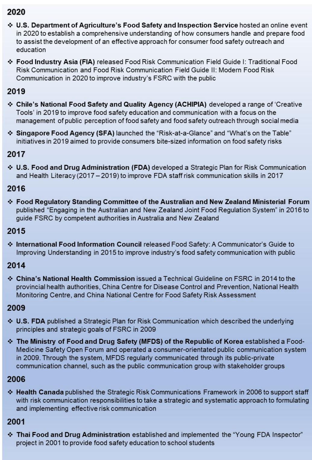
Fig. 1. Examples of FSRC efforts by competent authorities and food industry of the APEC region between 2001 and 2020

Principle 2 - transparency and timeliness - emphasizes that competent authorities’ FSRC systems should be transparent and open to scrutiny by stakeholders. This can be achieved through clear purpose, scope and intended outcomes of the communication, both verbal and written, as well as timely exchange of information between competent authorities and all concerned