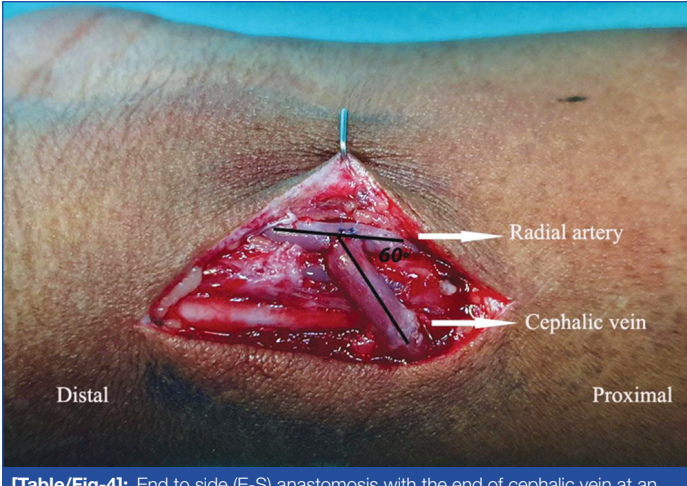
[Table/Fig-4]: End to side (E-S) anastomosis with the end of cephalic vein at an angle of about 60° to the radial artery.