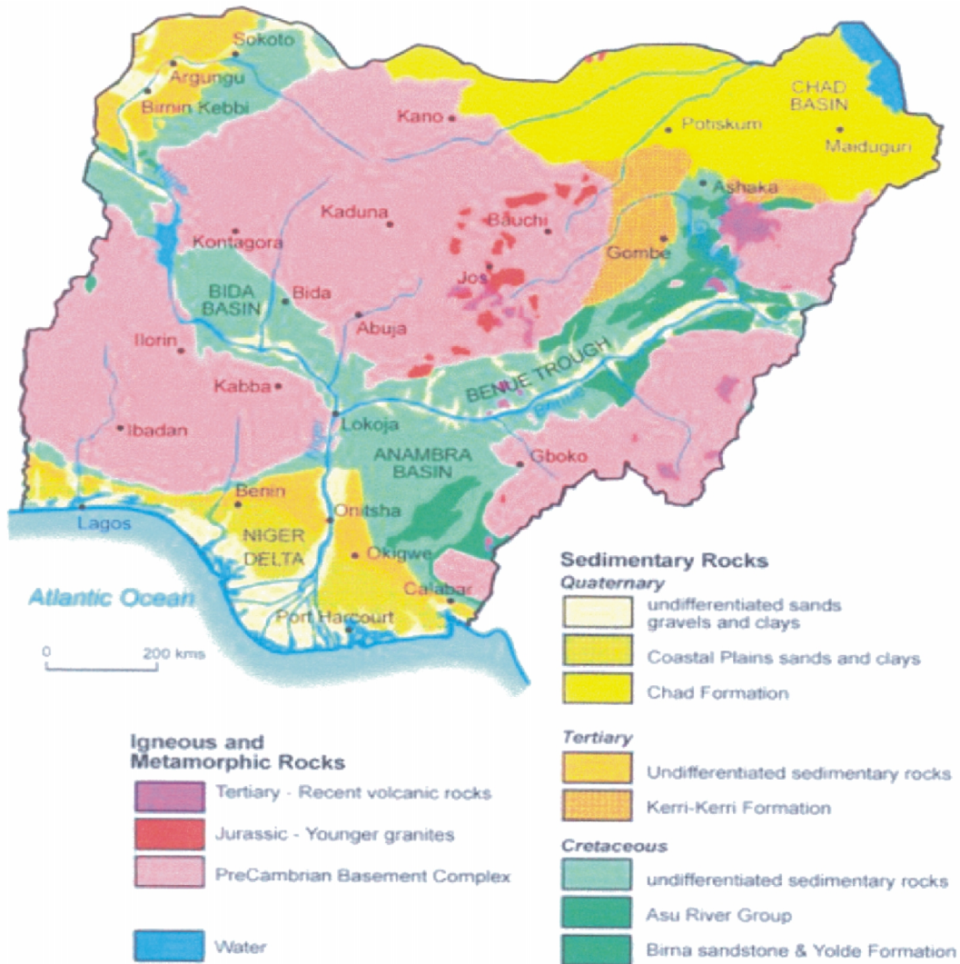
Fig. 1. Geology and mineral resources in Oyo State

Minerals can be classified into metallic, non-metallic or industrial, mineral fuels and gemstones. The metallic minerals can be further classified as precious, ferrous and non-ferrous (Fig. 1).