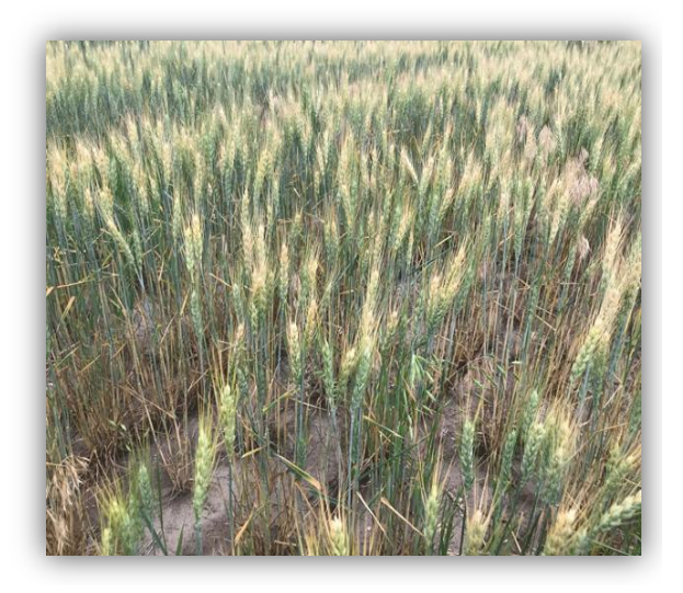
Fig. 1. Symptoms of terminal heat stress on wheat