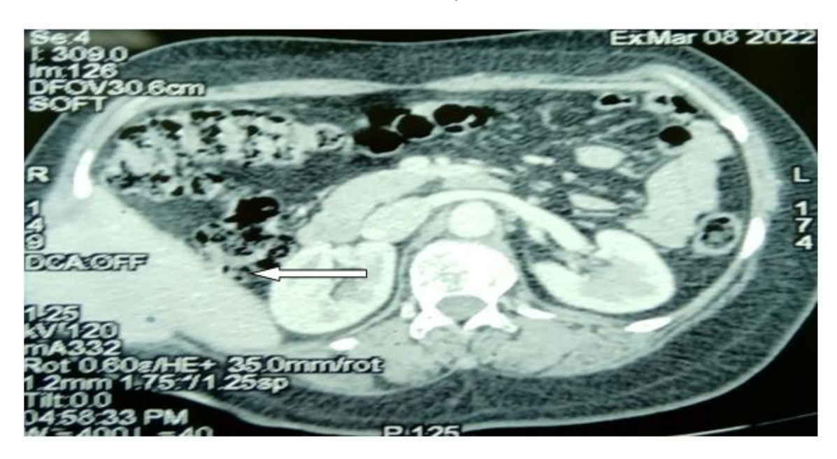
Fig. 3. CT scan showed a right lateral abdominal wall defect with hepatic content (arrow)

In view of the good post-operative evolution, the patient was declared discharged 2 days after surgery. 2 months later the patient underwent a routine follow-up examination, with better improvement.