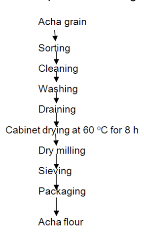
Fig. 1. Production of Acha flour (Modified from Avo et al. [15])

of microorganisms, water was sprinkled twice a day at the intervals of nine (9) h. The seeds were allowed to germinate for 96 h at room temperature and cabinet dried at 60 ^{\circ} C for 8 h, devegetated by hand rubbing, winnowed and milled into flour using hammer mill (Bremmer, Germany). The flour was sieved with the aid of a 425 \mu m sieve (Endecotts Ltd, London, England) to obtain a uniform particle size of flour which was packaged in polyethylene bag and stored at 4-6 ^{\circ} C till needed as presented in Fig. 2.