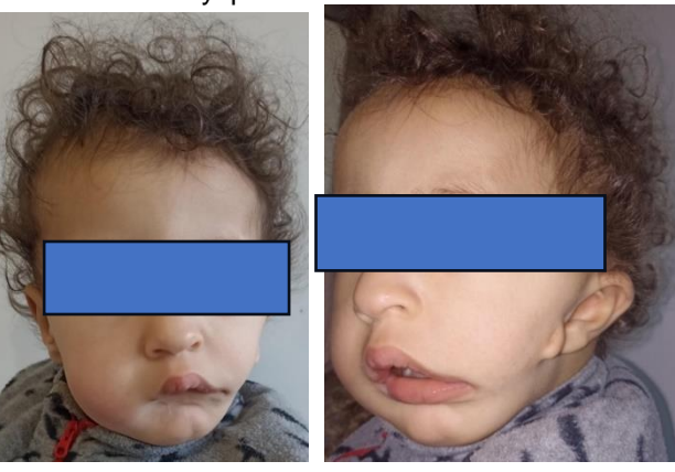
Fig. 2. Photos of the patient showing the malformations of cleft 7

We classified the patient's macrostomia as type 1 or minor commissural cleft (Fig. 4) where the lips of the cleft side end anterior to the anterior edge of the masseter [6].