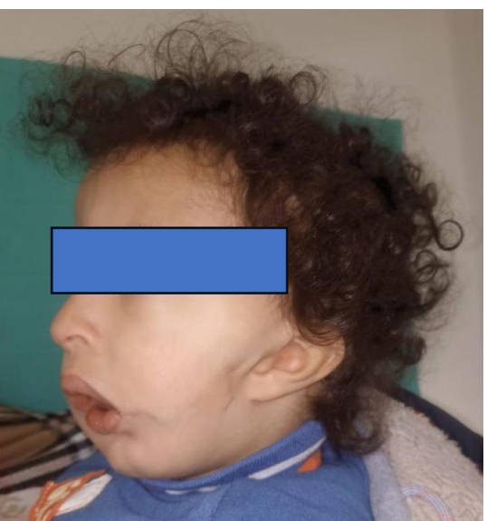
Fig. 6. appearance of the patient 6 months postoperatively