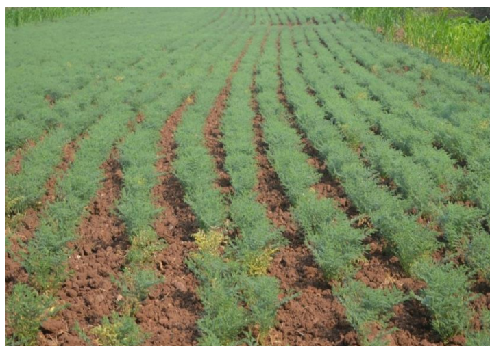
b. Kerimallapur (Haveri)