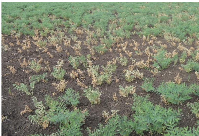
a. Hirebagevadi (Belagavi)