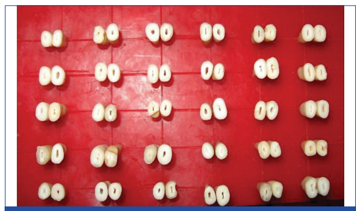
[Table/Fig-1]: Decoronated matched paired root canals of teeth.

A digital radiograph was taken twice in a mesiodistal and buccolingual direction to confirm the presence of a single canal. The radicular portion was obtained by decoronating the cementoenamel junction with the help of a diamond disk [Table/Fig-1].