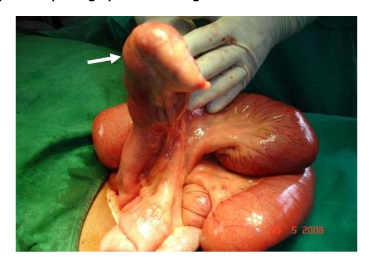
Fig. 3. Intra operative photographs Showing Giant MD of size 12x4\ cm